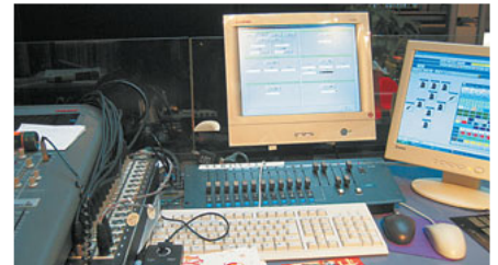
Control PC installed in the DJ booth simplifies control of a wide range of input and output sources.