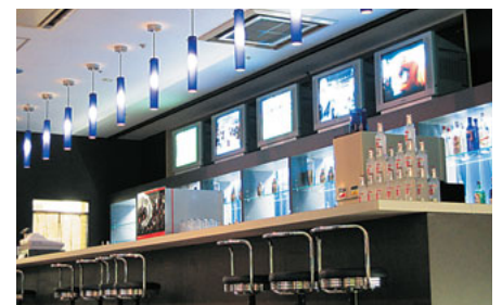
Five CRT displays installed behind the counter bar.