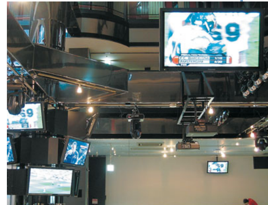
Multiple displays positioned in a carefully planned layout to take the best possible advantage of the installation plan.

The nine plasma displays are hung on a pillar in the center of the café with three panels each on three levels, simultaneously giving three types of content through 360° to viewers anywhere on the main floor (see next page). The innovative layout takes maximum advantage of the slim profile, light weight, wide screen, and wide viewing angle offered by plasma displays. Plasma displays are an ideal choice for any sports café