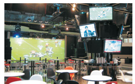
Plasma displays installed on the pillar (right) and two 150-inch screens (left).