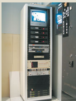
The video sources are installed in an equipment box beside the entrance.