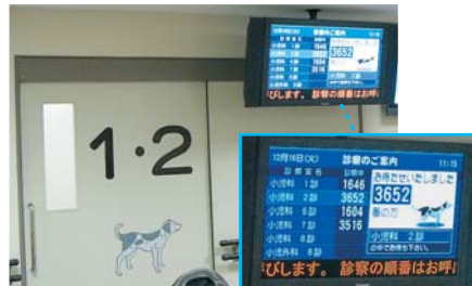
The door to the pediatric examination room has a cute animal illustration printed onto it, and the display panel shows the same illustration when calling a patient.