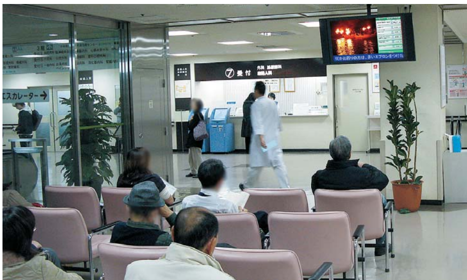
The scheduler switches the screen display between call numbers and general hospital information. An Advanced Dual Picture Mode also enables titles to be displayed. (The screen image in the photo is simulated.)