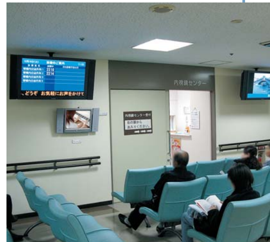
The display panel shows call numbers clearly. Since the panel displays the waiting list, it minimizes patient stress and allows everyone to check whether they have been called or not when, for example, they return from the lavatory. (The screen images in the photo are simulated.)

To solve these problems, the hospital decided to look into the installation of a Call Display System. To meet its needs, we proposed a system configured with NMstage and plasma displays.