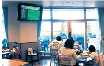
A display panel installed in the hospital restaurant shows the patient waiting status.

to NMstage's excellent scalability, the system kept operations going smoothly even when about 30 additional display panels were installed.