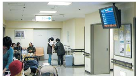
Since the plasma display shows images clearly even when viewed at an angle, it can provide information to many patients even if it is installed near a passage in the back of the waiting area.