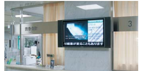
The Advanced Dual Picture Mode of the plasma display simultaneously shows hospital announcements and a background video from a DVD disc.