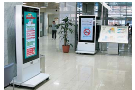
Two display panels set up in portrait orientation at the entrance announce seminars that are being held in the hospital and show general hospital information.